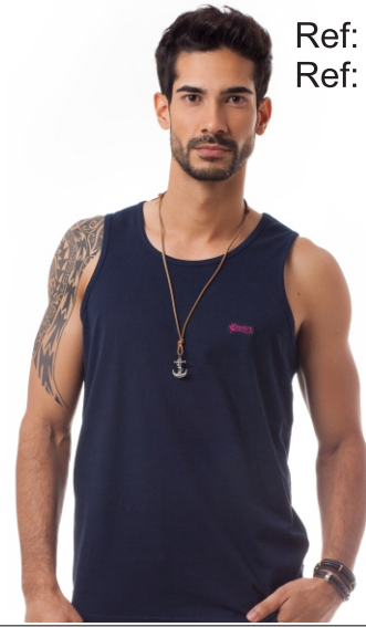
Ref: 287 Ref: 287-PS