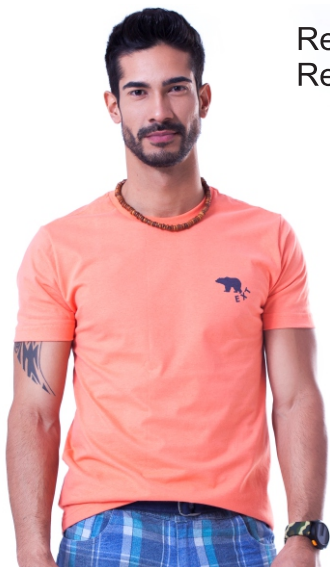
Ref: 201 Ref: 201-PS