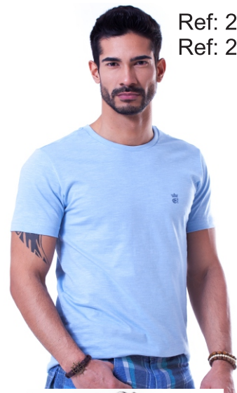
Ref: 203 Ref: 203-PS