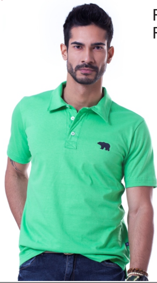
Ref: 903 Ref: 903-PS