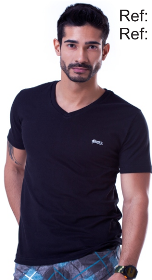
Ref: 202 Ref: 202-PS