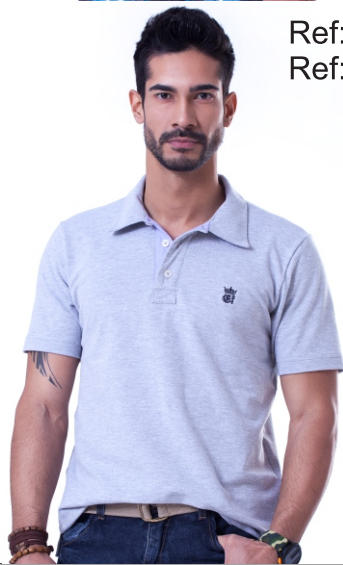
Ref: 924 Ref: 924-PS